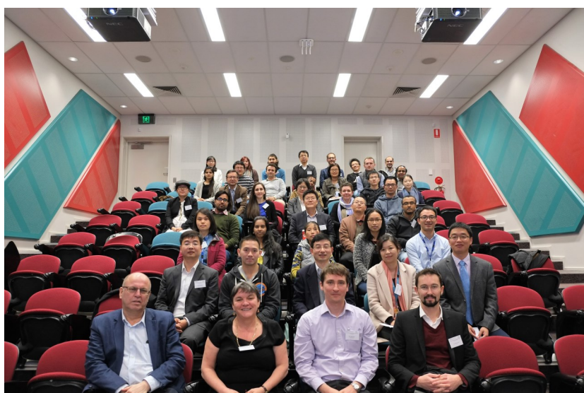
Photo session after the workshop with participants and speakers.

The MSA workshop on advanced membrane technologies was held in Monash University on the 20th of July 2016 with speakers from Monash University, Melbourne University, Victoria University, UNSW, University of Wollongong, Adelaide University, Curtin University, UQ, UTS, CSIRO and Deakin University invited to share their recent work and ideas on membrane technologies.